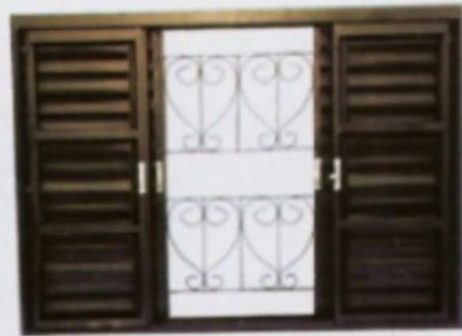
venetian sliding (grid heart)