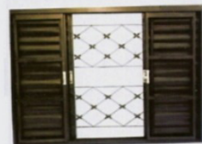
venetian sliding (Chess grid)