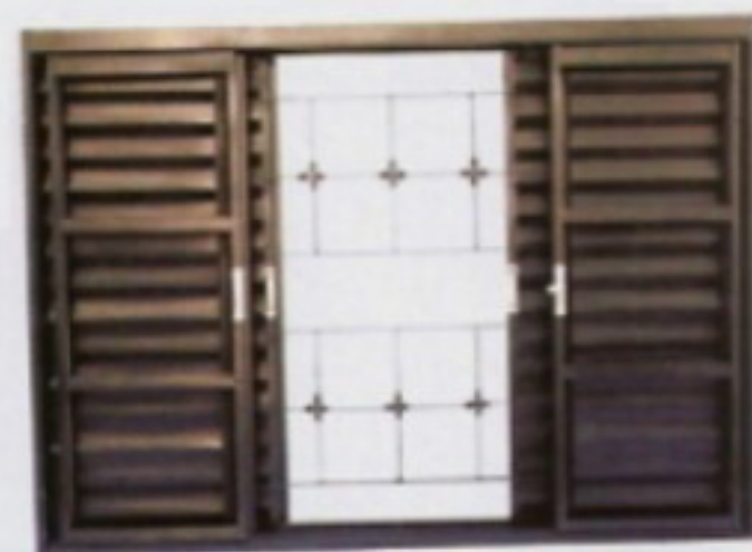
venetian sliding (Checkered grid)