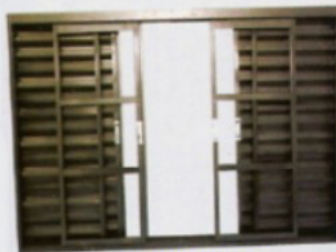
venetian sliding (without grid)