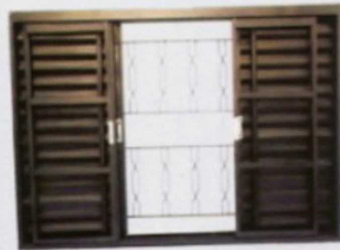
venetian sliding (grid current)